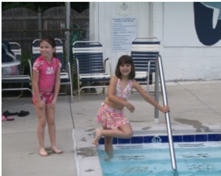
"My foot is in, see, I'm the first one in!"